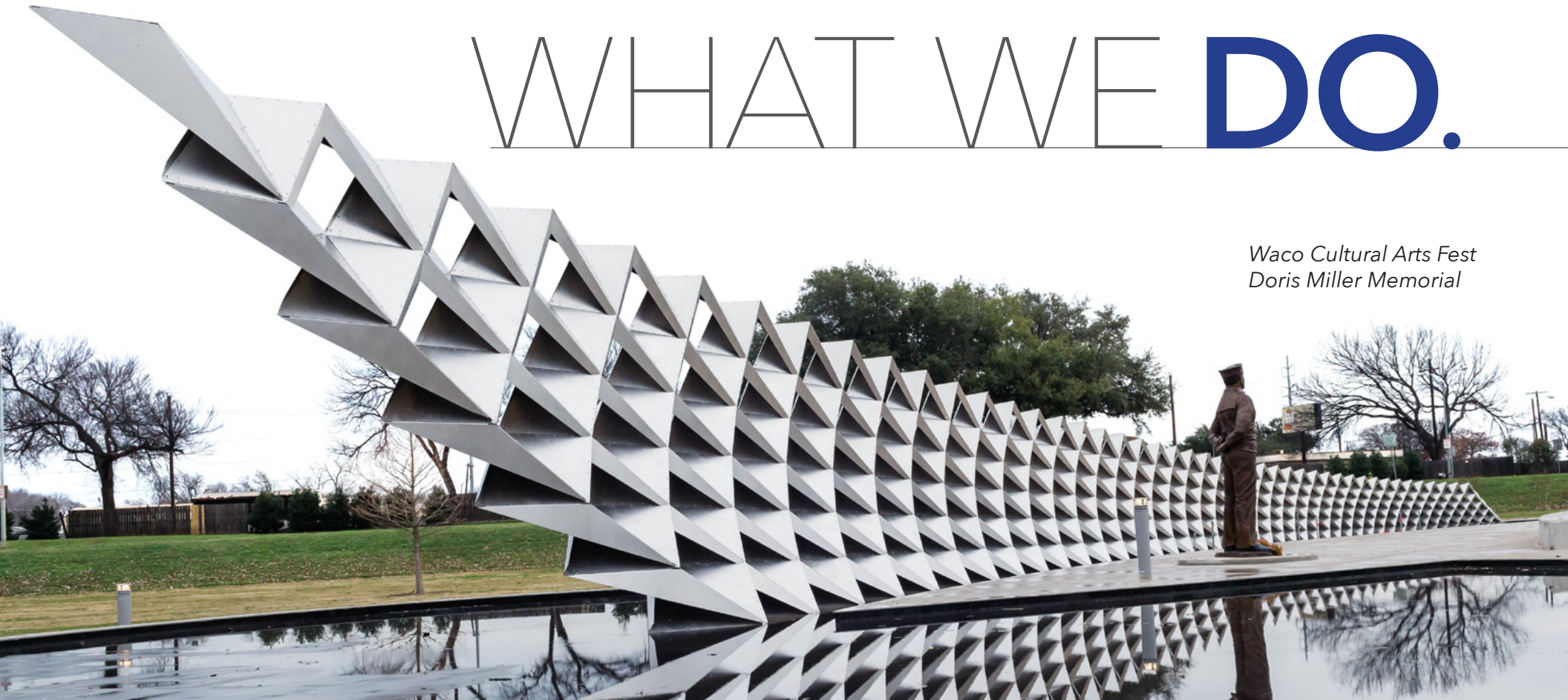
Waco Cultural Arts Fest Doris Miller Memorial