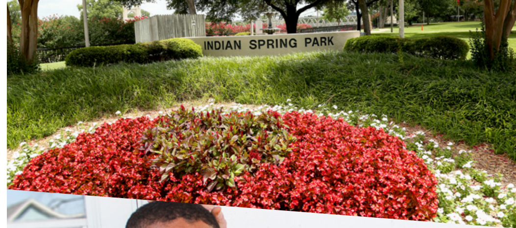
The Cooper Foundation funded Indian Spring Park's Amphitheater.